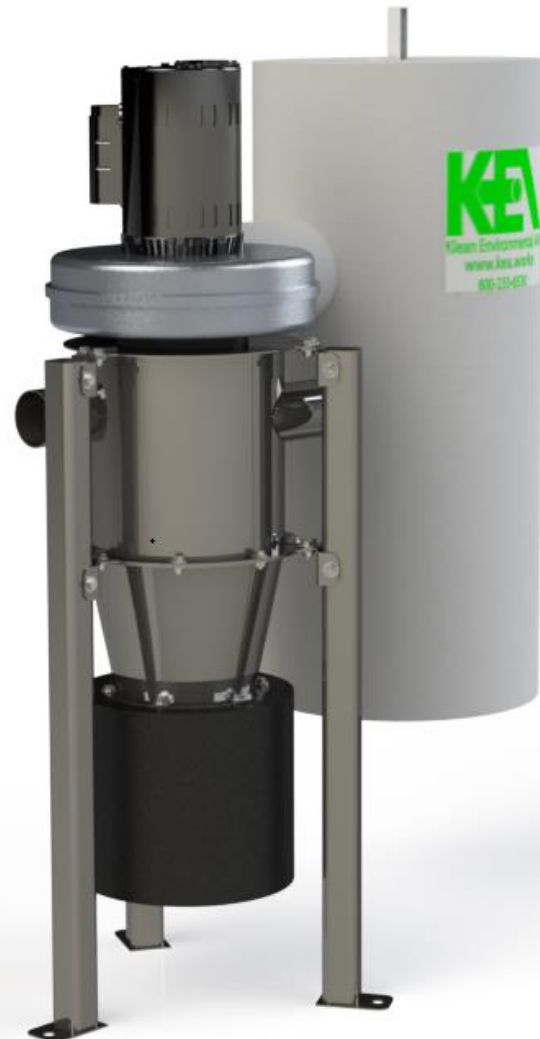
MODEL 2905 with ½ HP Motor (450 CFM)